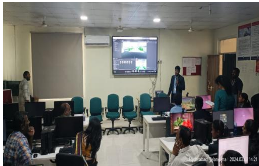
Feedback by Students