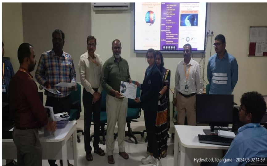
Certificate Distribution-Chief Guest & Principal